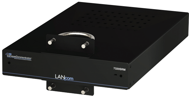
LC372SR with LC372PMK Pole Mount Kit