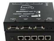
MultiView T5A Transmitter 400R3006