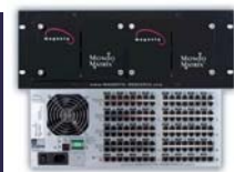
Mondo Matrix Cat5 Switch 16x16—256x512 221R3001