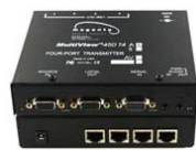
MultiView T4A Transmitter 400R2960