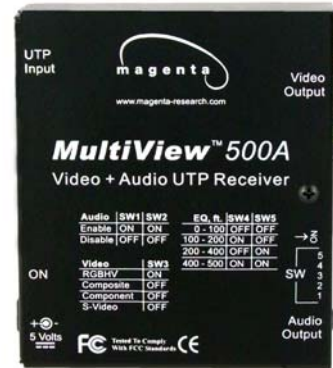
MultiView 500A Receiver 400R3540

User configurable, HD-ready receivers with options for video + audio or video + simplex/duplex RS-232