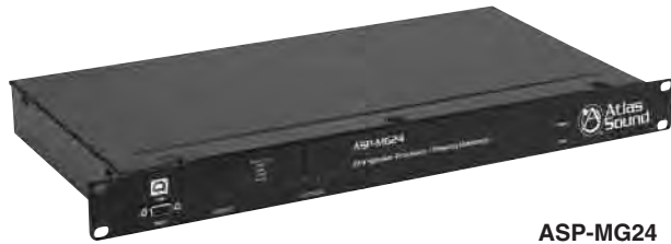
ASP-MG24 (Front Panel)